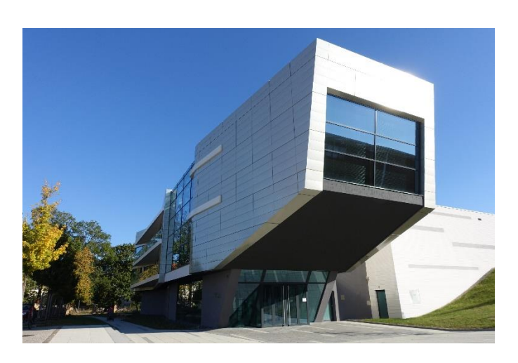
2021 - HiLASE Centre building