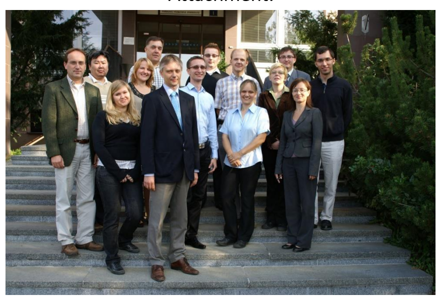
2011 - HiLASE Centre team