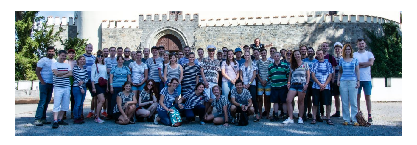
2021 - HiLASIANS - teambuilding