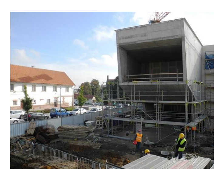
2013 – Construction of the HiLASE Centre building