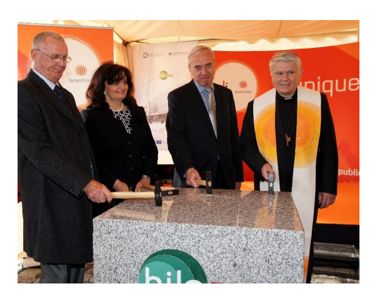
2012 - Cornerstone laying ceremony