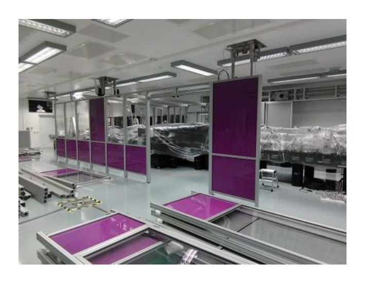
2016 - Instalation of laser BIVOJ system