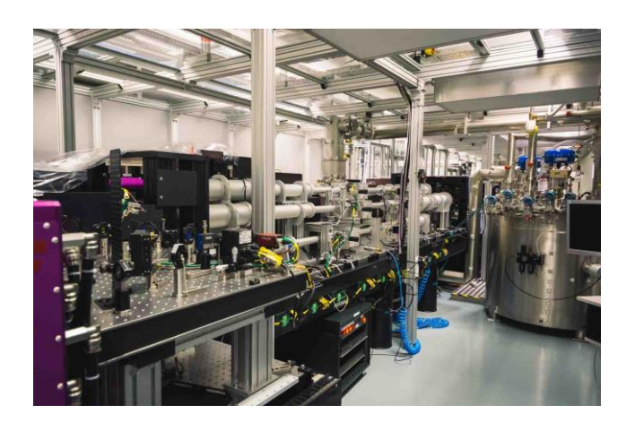
2021 – BIVOJ laser system