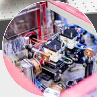
DETAIL OF THE MAIN AMPLIFIER CAVITY