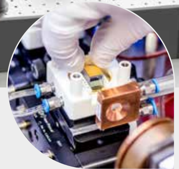
POCKELS CELL IN THE MAIN AMPLIFIER